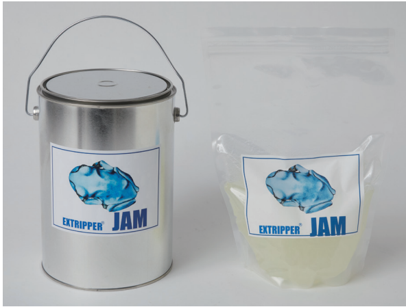
EXTRIPPER® JAM NET: 5L can/1L bag

The creation of EXTRIPPER® JAM/Bikan proudly developed in-house by our company, upends the philosophy of cleaning. The solid substance "JAM" and the liquid "Bikan" are made from everyday ingredients that are gentle on the environment. They can be used repeatedly without having to replace the liquid for a fixed period of time. They work on through holes smaller than 1mm and significantly reduce the time cost of paraffin wax-based support material cleaning.